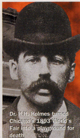
Dr. H.H. Holmes turned Chicago's 1893 World's Fair into a playground for death